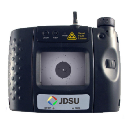
HD2-P4-V Handheld Display with 3.5-in LCD